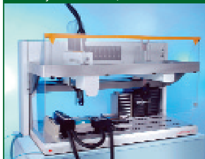
Figure 3: The ProTeam Digest Workstation automates sample processing (digestion, desalting and concentration) and spotting onto the MALDI target plate.